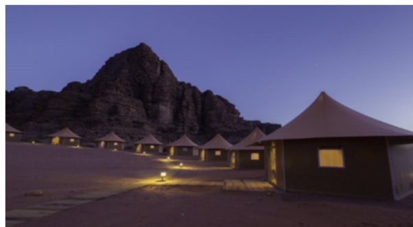
Aicha Luxury Camp

WE WILL ENTER AND EXIT JORDAN THROUGH THE ISRAELI/JORDANIAN LAND BORDER AT THE ALLENBY KING HUSSAIN BRIDGE CROSSING. NO FLIGHTS ARE REQUIRED.